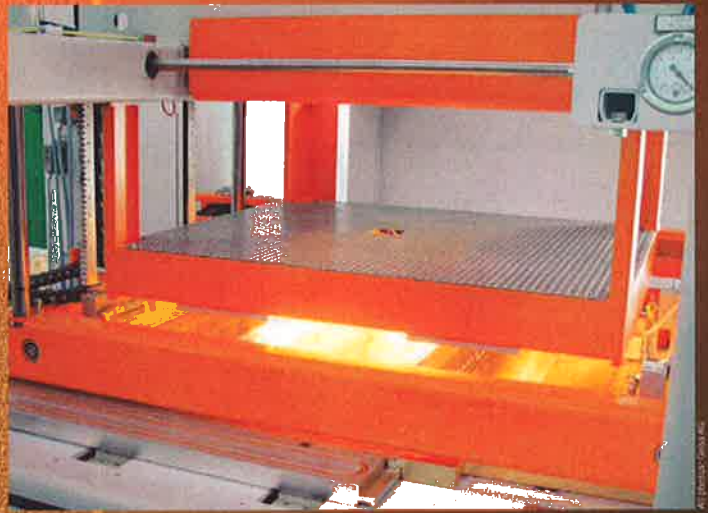
Thermoplastics are softened by heating and pulled over the tool by a vacuum

UL approval of switching technology simplifies export of vacuum-forming machines